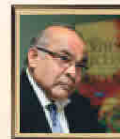
Dr. Y. B. Reddy Former Governor Reserve Bank of India