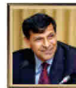
Dr. Raghuram Rajan Former Governor Reserve Bank of India