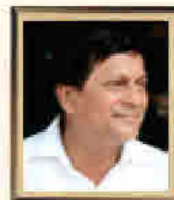
Dr. Achyuta Samanta Founder KIIT & KISS University (Bhubaneswar) Member of Parliament