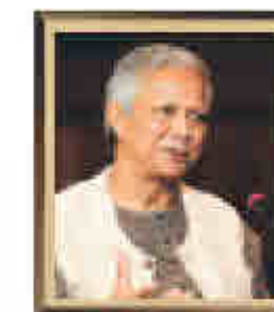
Prof. Muhammad Yunus Nobel Laureate