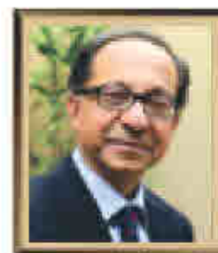
Prof. Kaushik Basu President International Economic Association